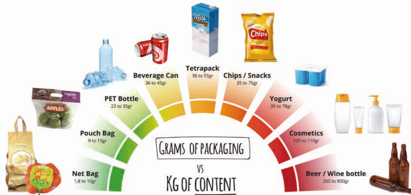
This chart shows the weight of different types of packaging needed to contain 1 kg of product. In each type the usual range of values is indicated, taking into account that the packaging size and possible variants can significantly affect the weight of the pack to contain 1 kg of product.

For more than 50 years, Giró has been committed to the environment, sustainable development and recycling. The unique breathability and visibility of the net bag not only makes product attractive, it is an extremely light package made with 100% recyclable materials. Giró net packaging systems has the best content/material ratio in the fast moving goods industry making them the most sustainable in the horticultural market.